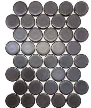
SSE-870 Shadow Matte