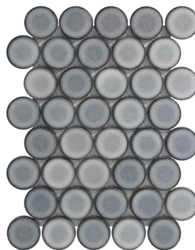
SSE-869 Slate Matte