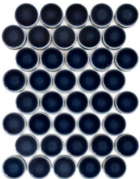
SSE-868 Navy Glossy