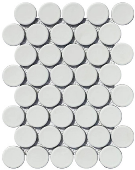
SSE-865 White Matte