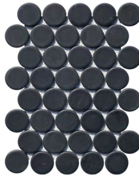
SSE-866 Onyx Matte