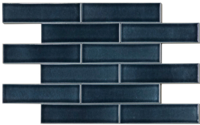
SSE-874 Navy Glossy