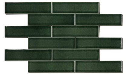
SSE-873 Sage Glossy