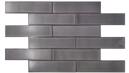
SSE-876 Shadow Matte