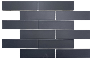
SSE-872 Onyx Matte